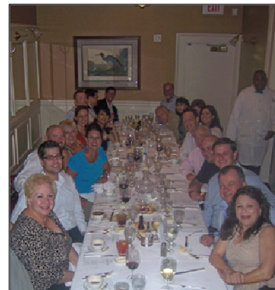
Coinmach and AW feast at Galatoire's.

To say this year's NAA event was one of the most successful would be an understatement. With months of team planning, the Coinmach and AW teams worked together, helping to further strengthen the existing bond between the two companies. Together at the show, CSC showed potential and current customers a holistic approach to apartment laundry solutions.